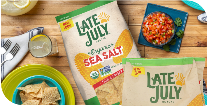
Late July Organic Restaurant Style Tortilla Chips (selected varieties)