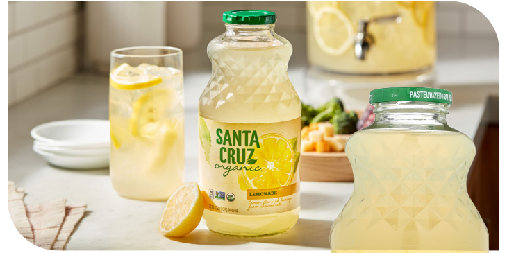
Santa Cruz Organic Lemonade (selected varieties)