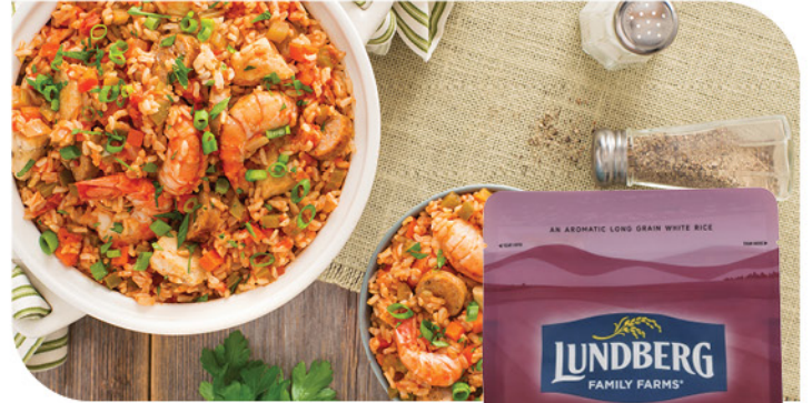
Lundberg Family Farms Rice (selected varieties)