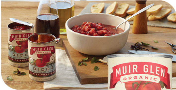
Muir Glen Organic Tomatoes (selected varieties)